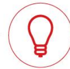
Back up loads